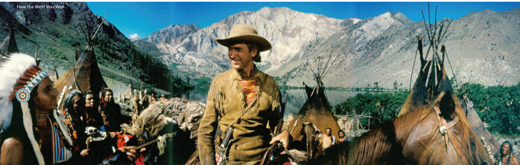
How the West Was Won