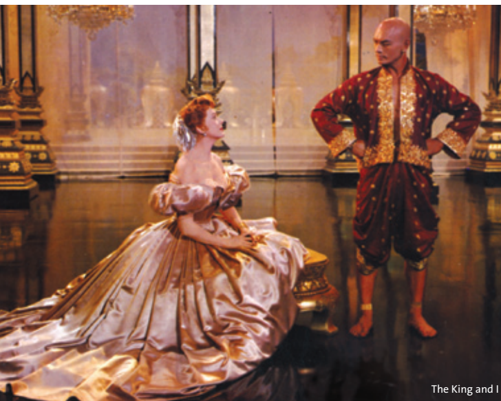
The King and I

WIDESCREEN PASSES £85 / £65 AVAILABLE FROM THE BOX OFFICE 0870 70 10 200