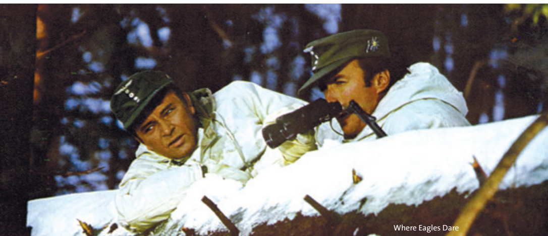
Where Eagles Dare