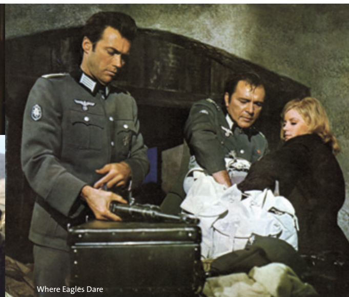
Where Eagles Dare