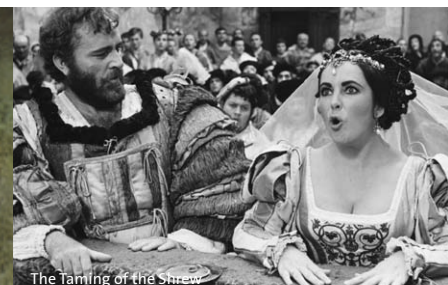
The Taming of the Shrew