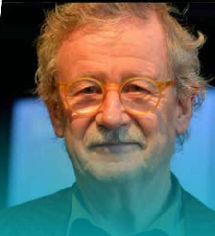
Sir Christopher Frayling